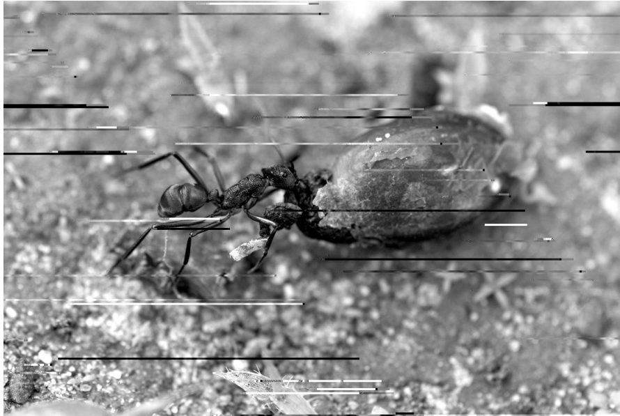
PLATE 1. A Rhytidoponera aurata worker transporting an Acacia dunnii seed in tropical savanna woodland outside Darwin, northern Australia. The worker is dragging the seed by the elaiosome. This is a large ant (8 mm length) and a large seed (12 mm length, 302 mg).

seeds in habitats dominated by the invasive Argentine ant, Linepithema humile , rarely escape the parental canopy and remain vulnerable to small-mammal predators (Bond and Slingsby 1984). Perhaps as a result, seedlings in invaded habitats are poorly dispersed and less than 1/10 as abundant (Bond and Slingsby 1984), in some cases even leading to local extinctions of plant species (Christian 2001). Why these problems occur, and whether we might expect similar disruption of this ant-plant mutualism after invasions by other exotic ants, is not yet well understood.